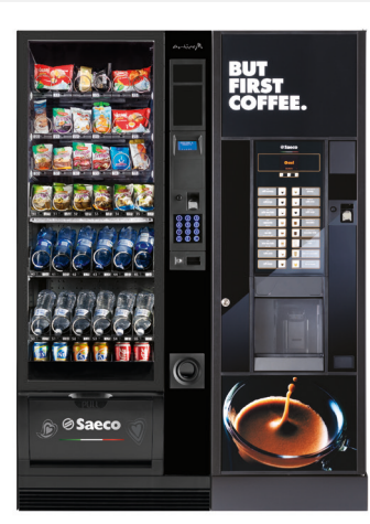
Artico M + Oasi 600