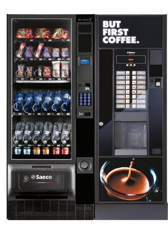
Artico S + Oasi 400